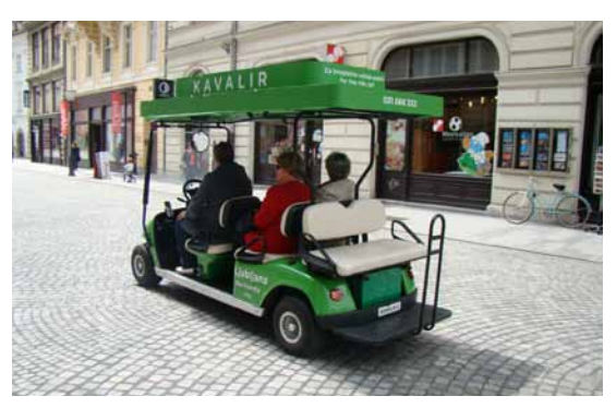
The Kavalir, a small electric vehicle offering a free service for shoppers, not only provides easy access in the city, but also creates jobs.

The mobility workstream came across two examples where concerted efforts to bring people together had resulted in successful outcomes.