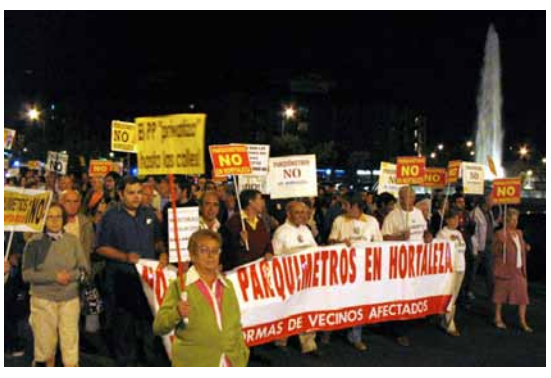
Demonstrations against parking policy in Madrid led to the creation of the Mobility Round Table

7 http://www.madrid.es/portal/site/munimadrid/ menuitem.650ba10afbb0b0aa7d245f019fc08a0c/?vgne xtoid=34a55876338af110VqnVCM1000000b205a0aRC RD&vgnextchannel=6091317d3d2a7010VgnVCM100000 dcOca8cORCRD (the first official communication about the Round Table was made with occasion of the first RSM about 2008, in 2009 winter)