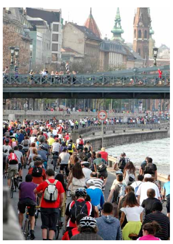
Critical Mass Cycling Movement, Budapest.

The case of the cycle intervention of Budapest is a good example of this approach. The city of Budapest is enjoying a cycling boom. Year after year a 40-50% increase in cyclists is seen on selected roads. The Hungarian Cyclists' Club4 is promoting facilities that have been tried and tested in other parts of the European Union to improve cycling infrastructure and campaign for change. "We can learn a lot from other cities. The London Sustrans bike infrastructure model has