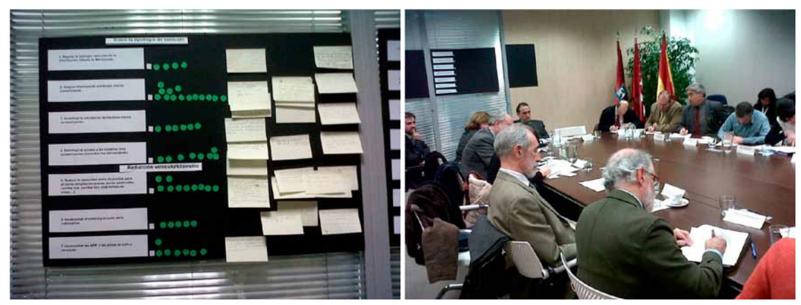
The Madrid Mobility Round Table bringing stakeholders together in Analysis and Discussion Workshops

briefings, inter-administrative dialogue, etc.). Secondly a series of task forces (named 'Analysis & Discussion Workshops') have been set up, which hold workshops and meetings involving a large number of stakeholders and tackling issues such as cycling policy and freight logistics. Their success has led to the Round Table becoming a permanent framework to agree mobility plans. The Round Table has been designated as the framework for the development of the diagnosis and proposals for the city's Sustainable Mobility Plan.